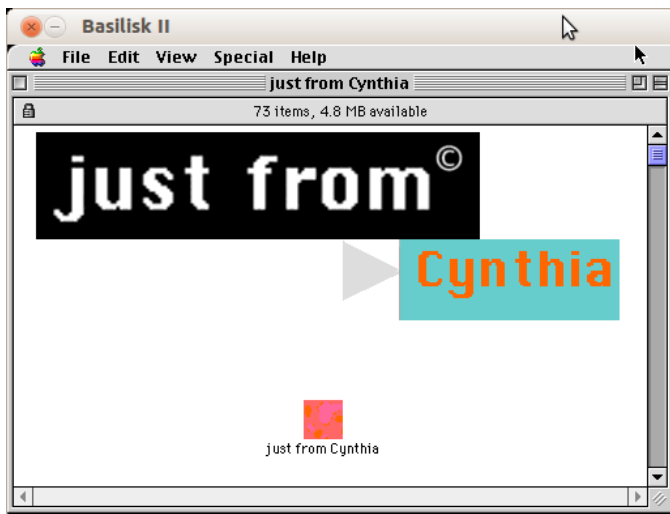
Figure 3. Graphical mosaic of icon files in Just from Cynthia .